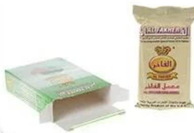
Bag Into Box