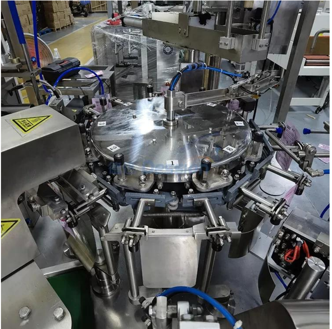
8 Rotary Work Table