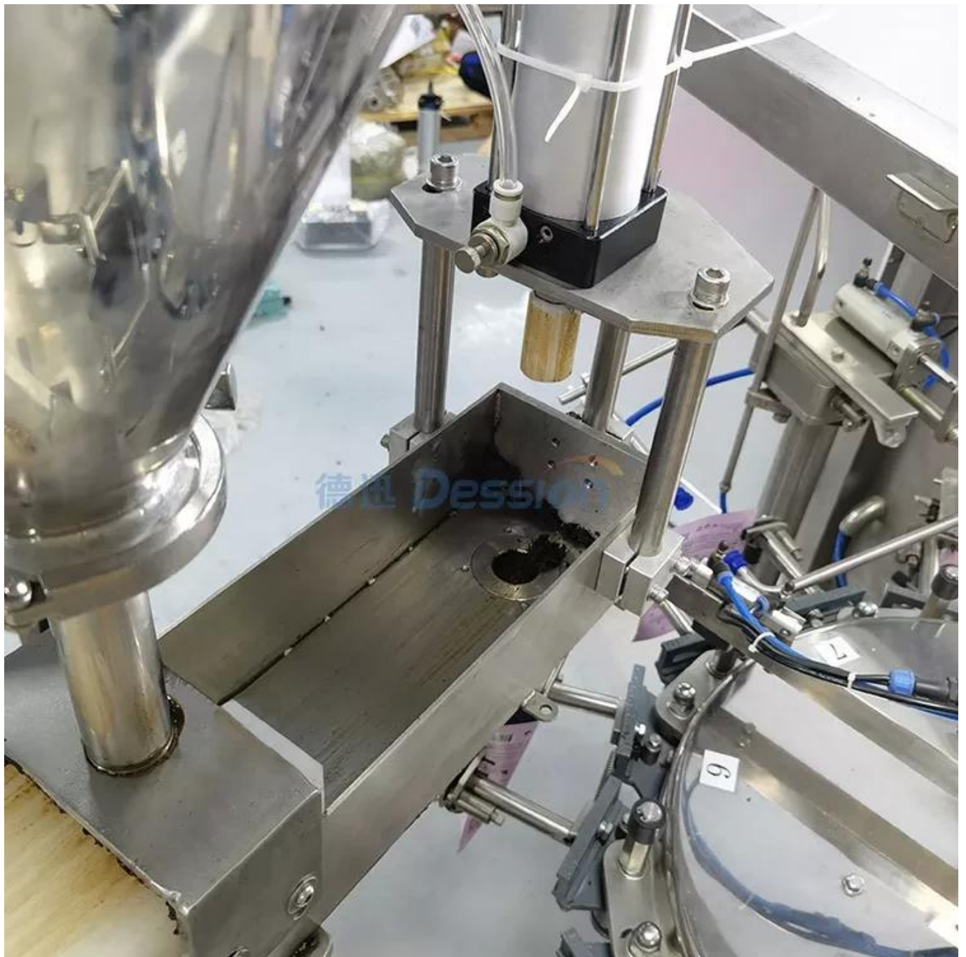
Pneumatic Pump filling