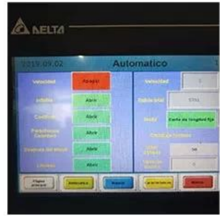
Touch Control Screen