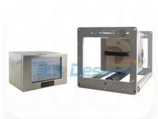
Thermal Transfer Printer