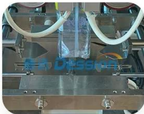
Angle Of Plug-In Device