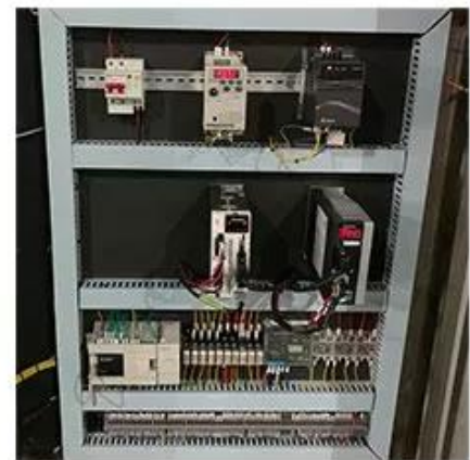
Machine Electrical Box