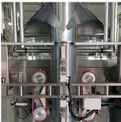
Back Seal Device and Bag Former