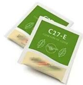
Inner and outer bag Square/Pillow tea bag