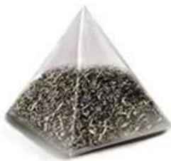
Nylon triangle tea bag