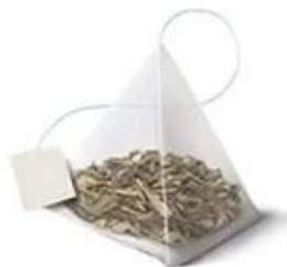
Triangle inner and outer bag