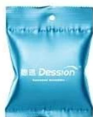
Back seal round hole