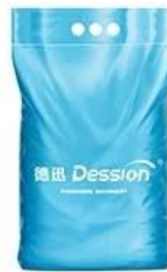
Vertical back seal