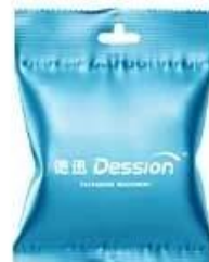
Back seal aircraft hole