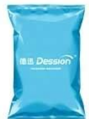
Standard back seal