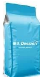
Quad seal bag