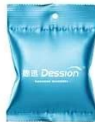
Back seal round hole