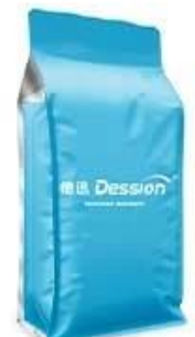
Quad seal bag