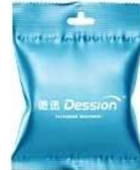
Back seal aircraft hole