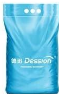
Vertical back seal