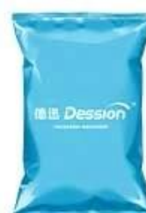
Standard back seal