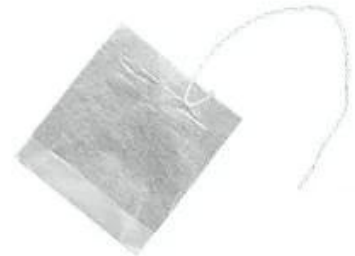
Tea bag with thread