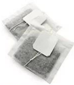
Tea bag with tag and thread