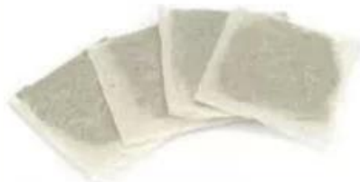
Square/Pillow tea bag