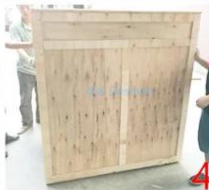
Nougat Flow Packing Machine Price in High Speed