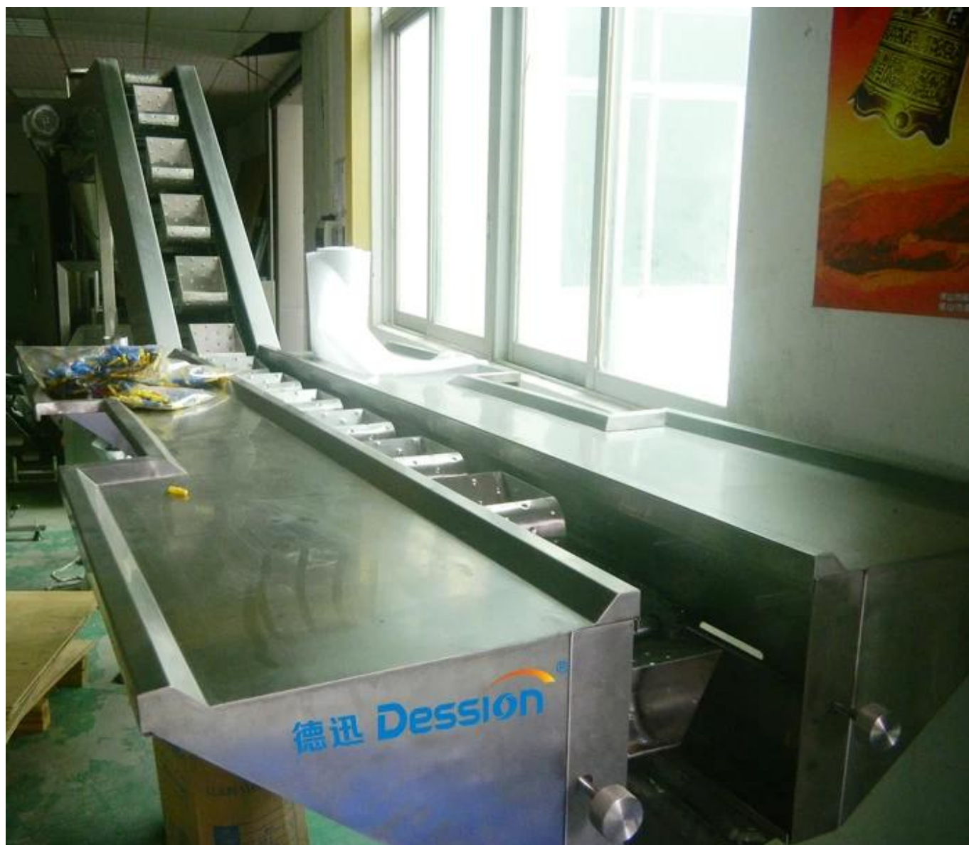
Material Hopper and goes in