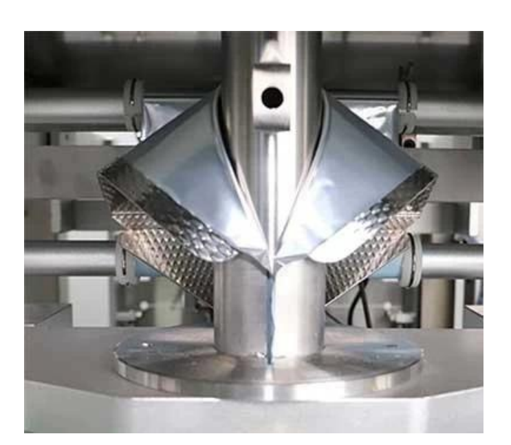
Bag former Drawn down by servo drive friction

Servo film-pulling and film-loading assembly, with the dancing arm moving up and down, realizing dynamic control of the film tension. The film travels above the eye-mark sensor, realizing precise film tracking and positioning.