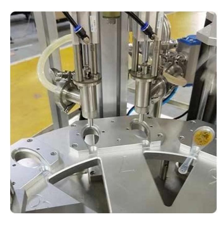
Pneumatic Metering Filling

The honey spoon heat sealing device controlled by the intelligent temperature control system can set the temperature according to the material of the film, and perfectly complete the sealing process of the capsule.