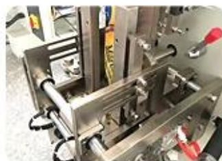
Four Side Sealing Mold