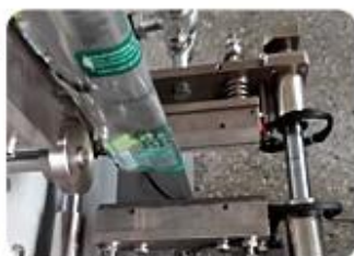
Three Side Sealing Mold