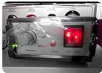
Encoder Heating Device