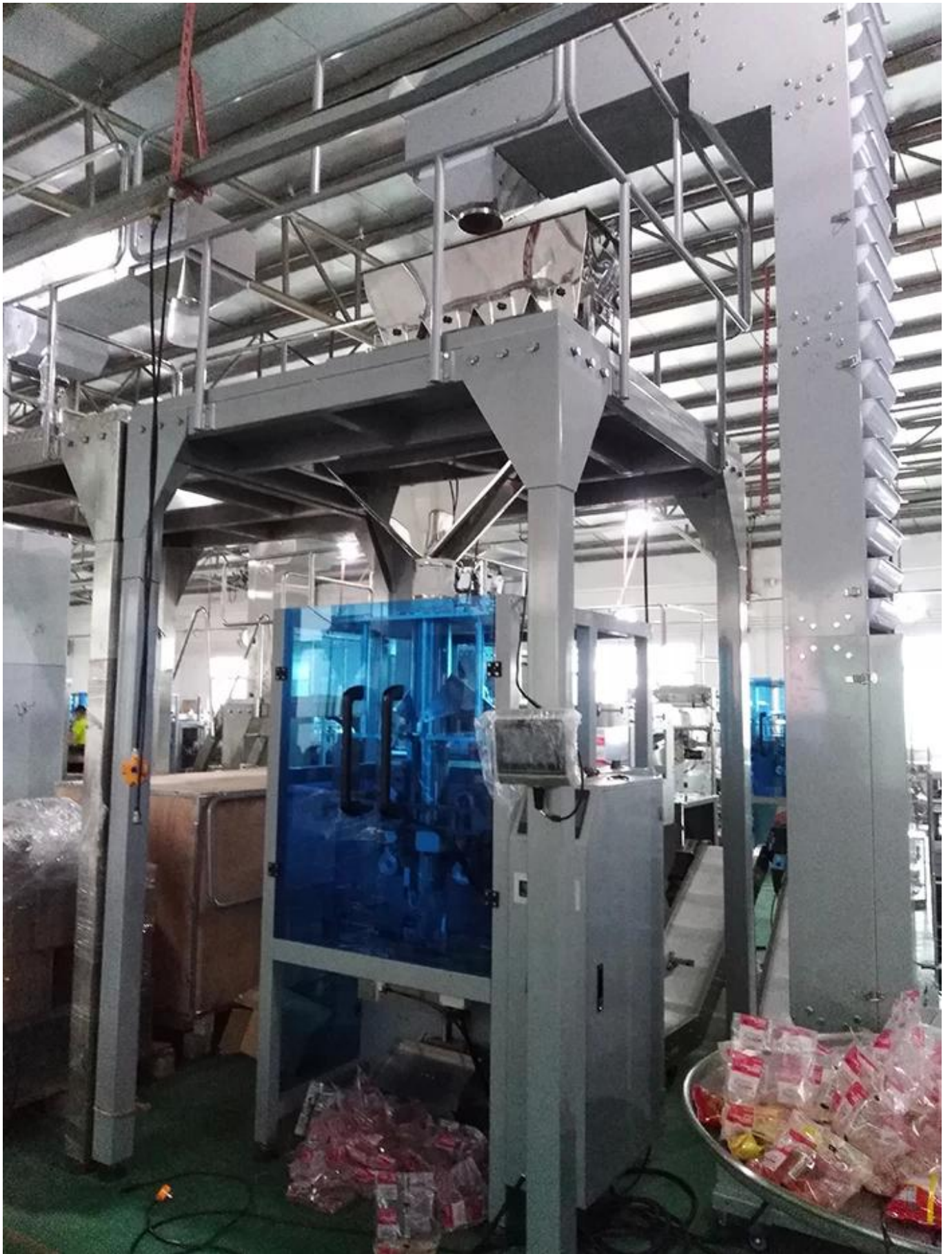
Put Material In The Z Charger