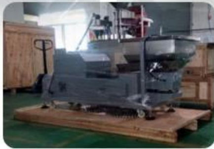
Wapping the Machine