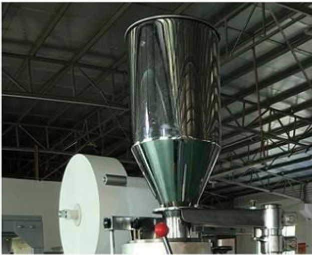
1.Put material into the Cup