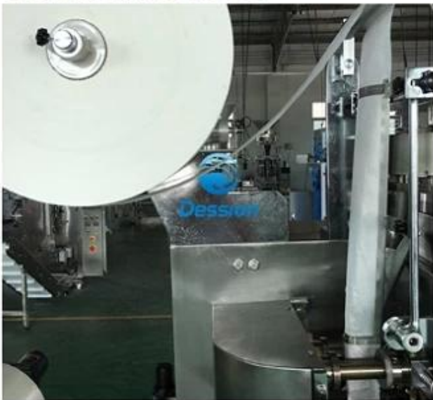
3.Inner Tea Bag Making