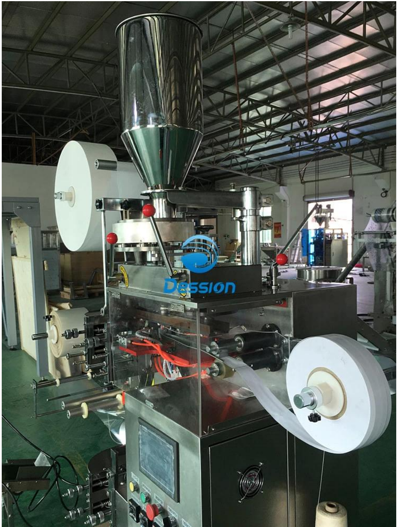
Machine Process for Tea Packer