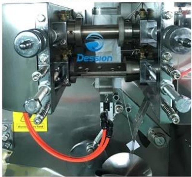
4.Put finished inner bag into device