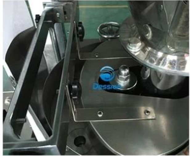
2.Cup Mearing to make the assign grams