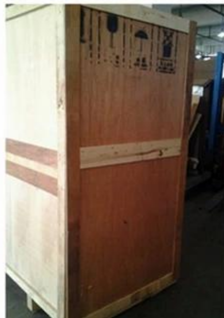
Tea Packaging Machine Weed In Sachets