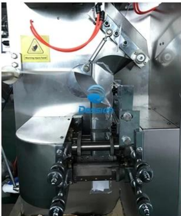
5.Outer Bag Making