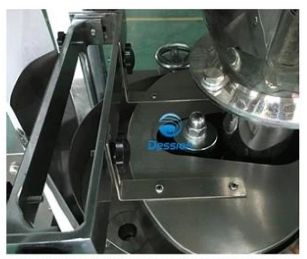
2.Cup Mearing to make the assign grams