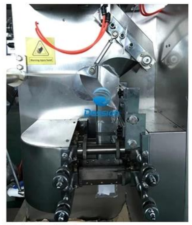
5.Outer Bag Making