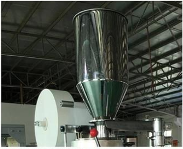
1.Put material into the Cup