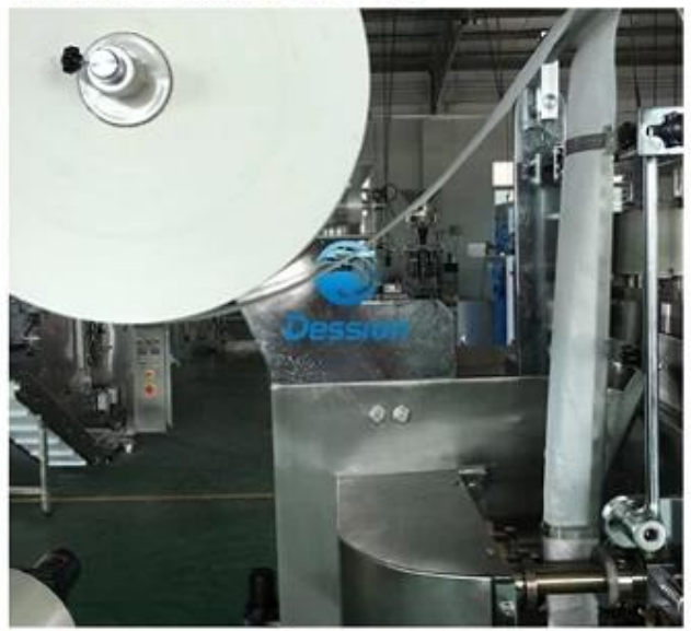
3.Inner Tea Bag Making