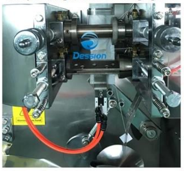
4.Put finished inner bag into device