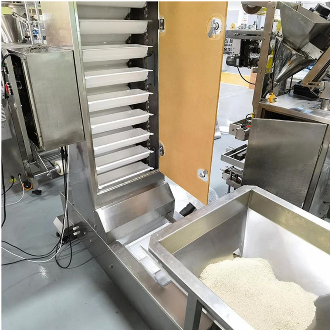
Z Type Elevator