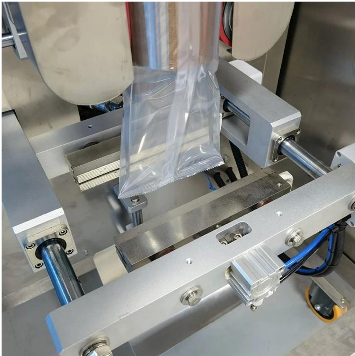
Bag cutting device