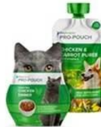
Special shaped bag