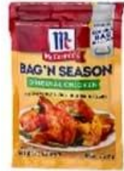
3/4 side seal bag