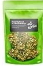
Stand up pouch bag