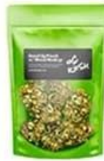
Stand up pouch bag