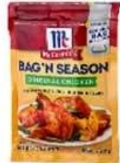
3/4 side seal bag