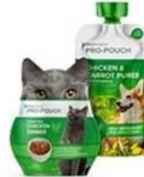
Special shaped bag