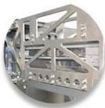
Bag feeding track