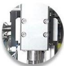
Capping servo motor