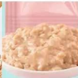
Pet meat paste