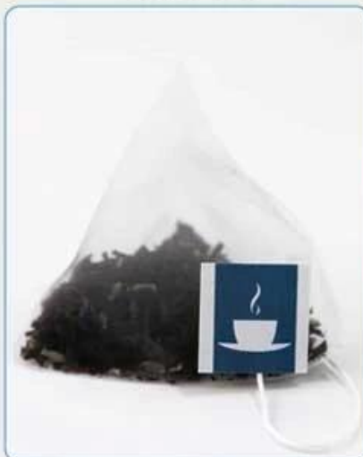
Pyramid Tea Bag