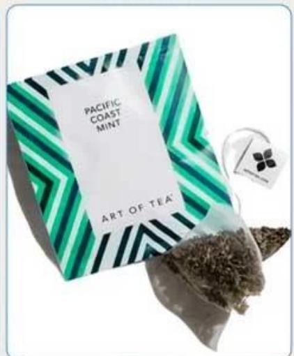
Tea Bag With Envelop