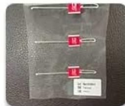
Corn fiber mesh