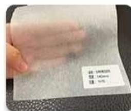
Corn fiber non-woven fabric