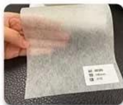
Ripple non-woven fabric