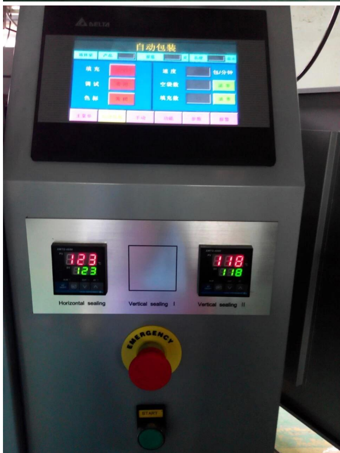
Package (CBM: 3.733m³ Gross Weight: 500kg)