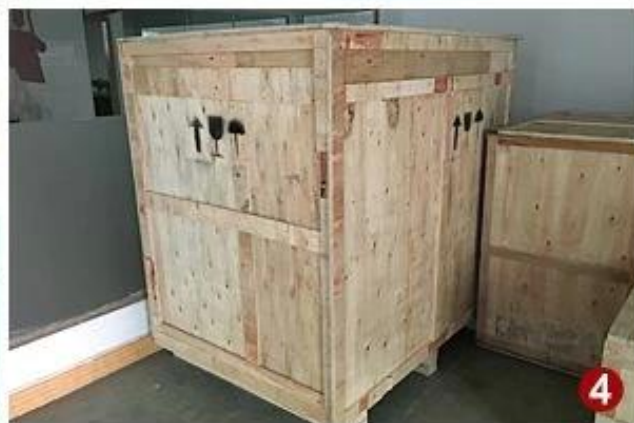
Automatic Sanitary Toothpick Packing machine