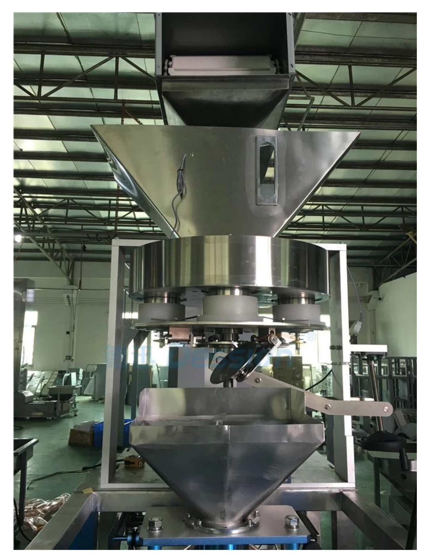
2. full itme go in and cup measuring