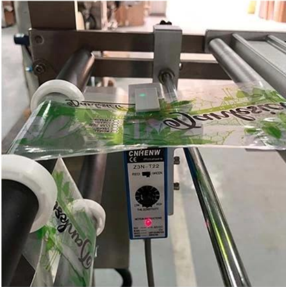
Ribbon coding machine (optional)