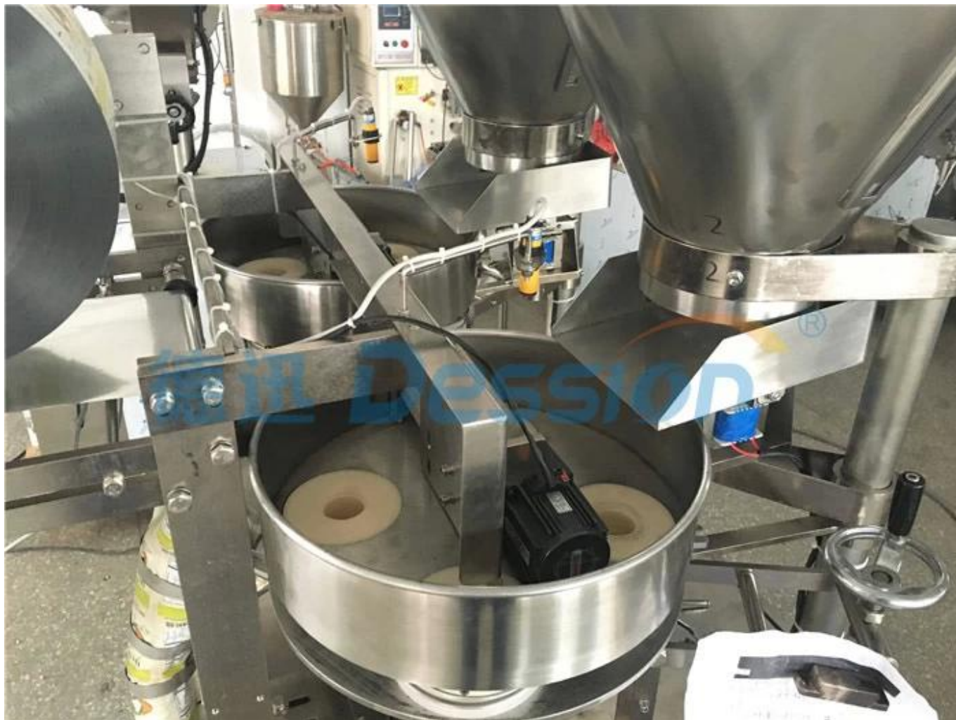
5.2 Cups Measuring