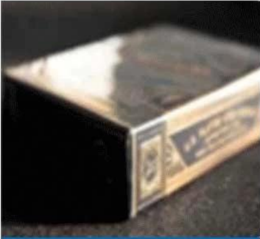
CIGARETTE / PACKING BOX