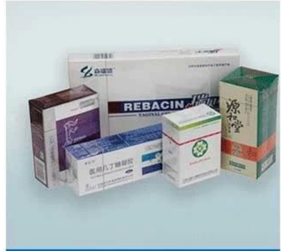
PILL BOX / GRANULES