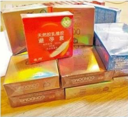
CONDOM / OUTER PACKAGING