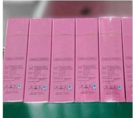
COSMETICS / SKIN CARE PRODUCTS