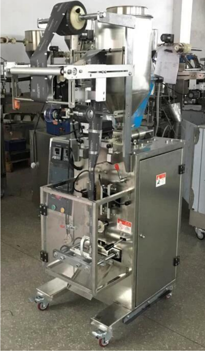
FRONT OF THE MACHINE