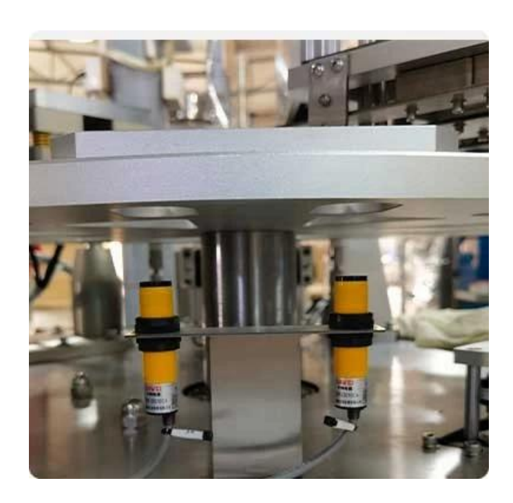
Electric eye device

The customized high-precision pneumatic metering and filling device has a special retraction device to ensure the accuracy of honey metering and filling. The range of filling can be set on the machine, and the operation is simple.