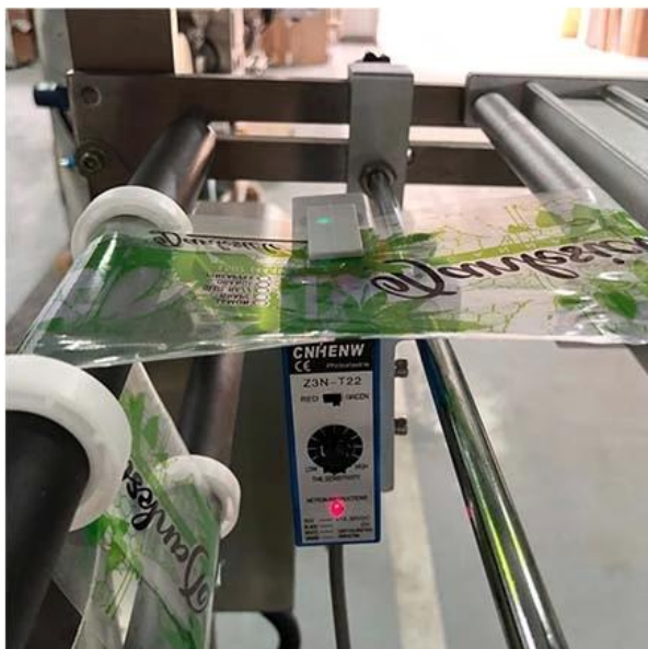
Ribbon coding machine (optional)