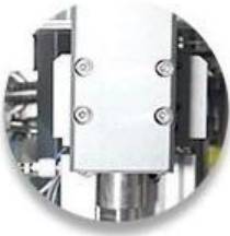
Capping servo motor