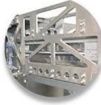
Bag feeding track