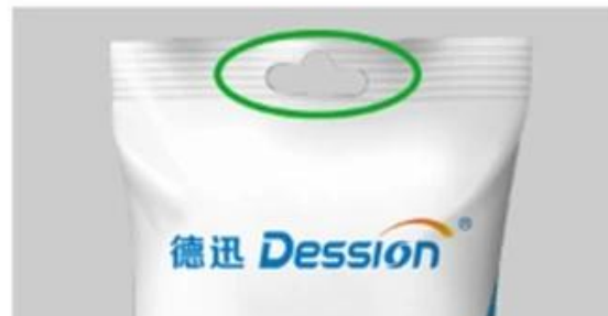
Bag With Hole