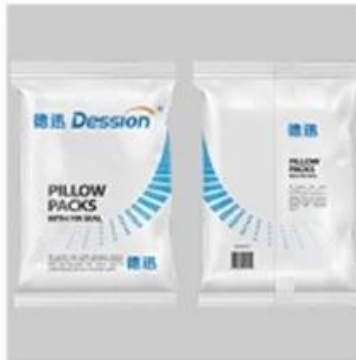
Back Seal Bag