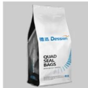
Quad Seal Bag