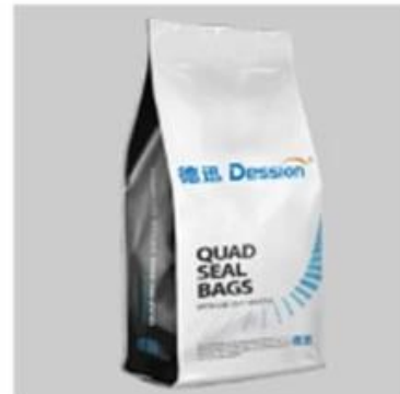
Quad Seal Bag