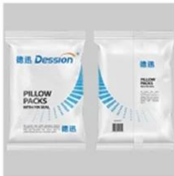
Back Seal Bag