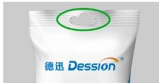
Bag With Hole