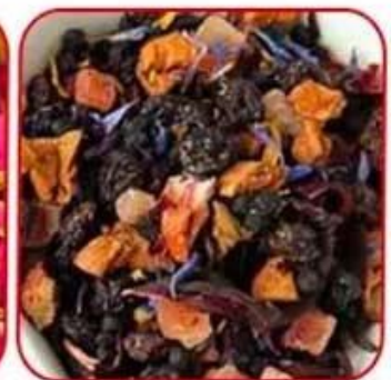
Particles of tea