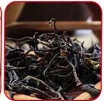
Ceylon black tea