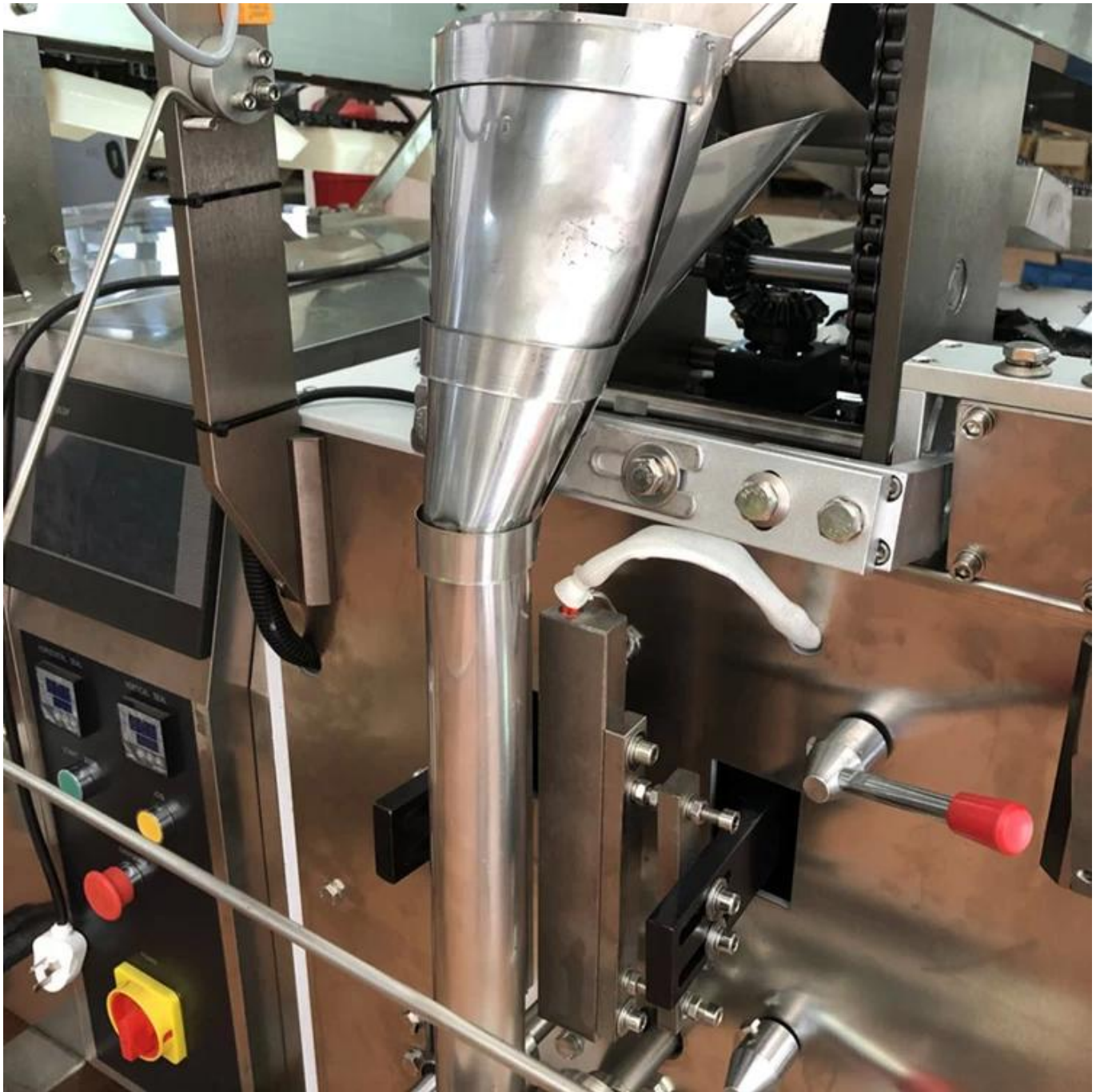
6) Sealing bar seal the bag