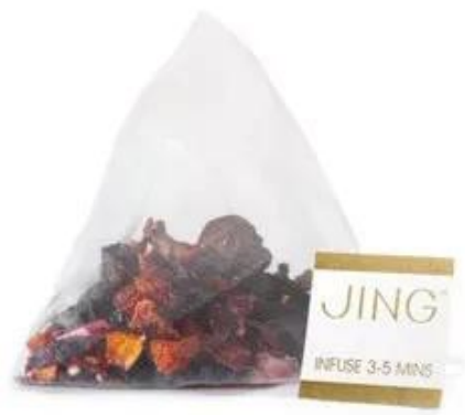
Triangle bag with line and label