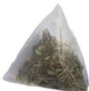
Triangle tea bag