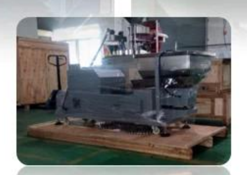
Wapping the Machine And Put into Wooden Case