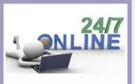
7-24 Hours services