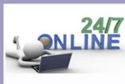
7-24 Hours services