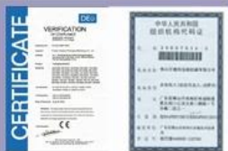
Tight quality control