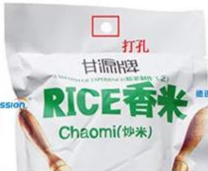
Round Punching Hole