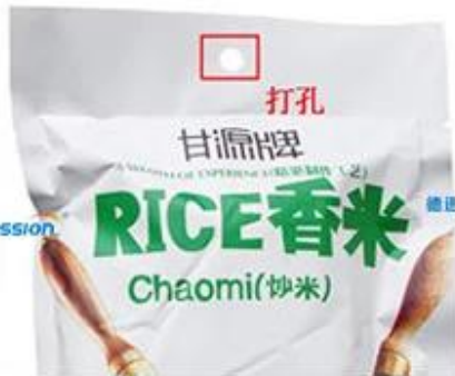
Round Punching Hole