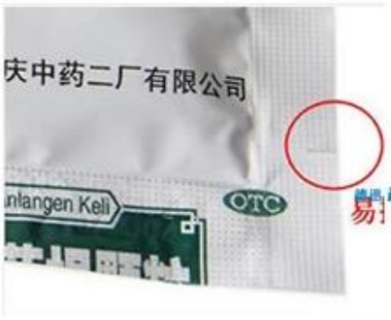
Easy Tearable device