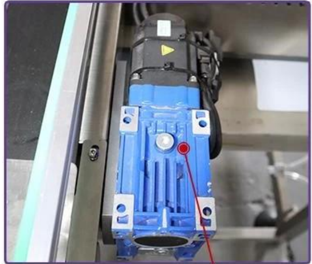
Conveyor belt servo motor