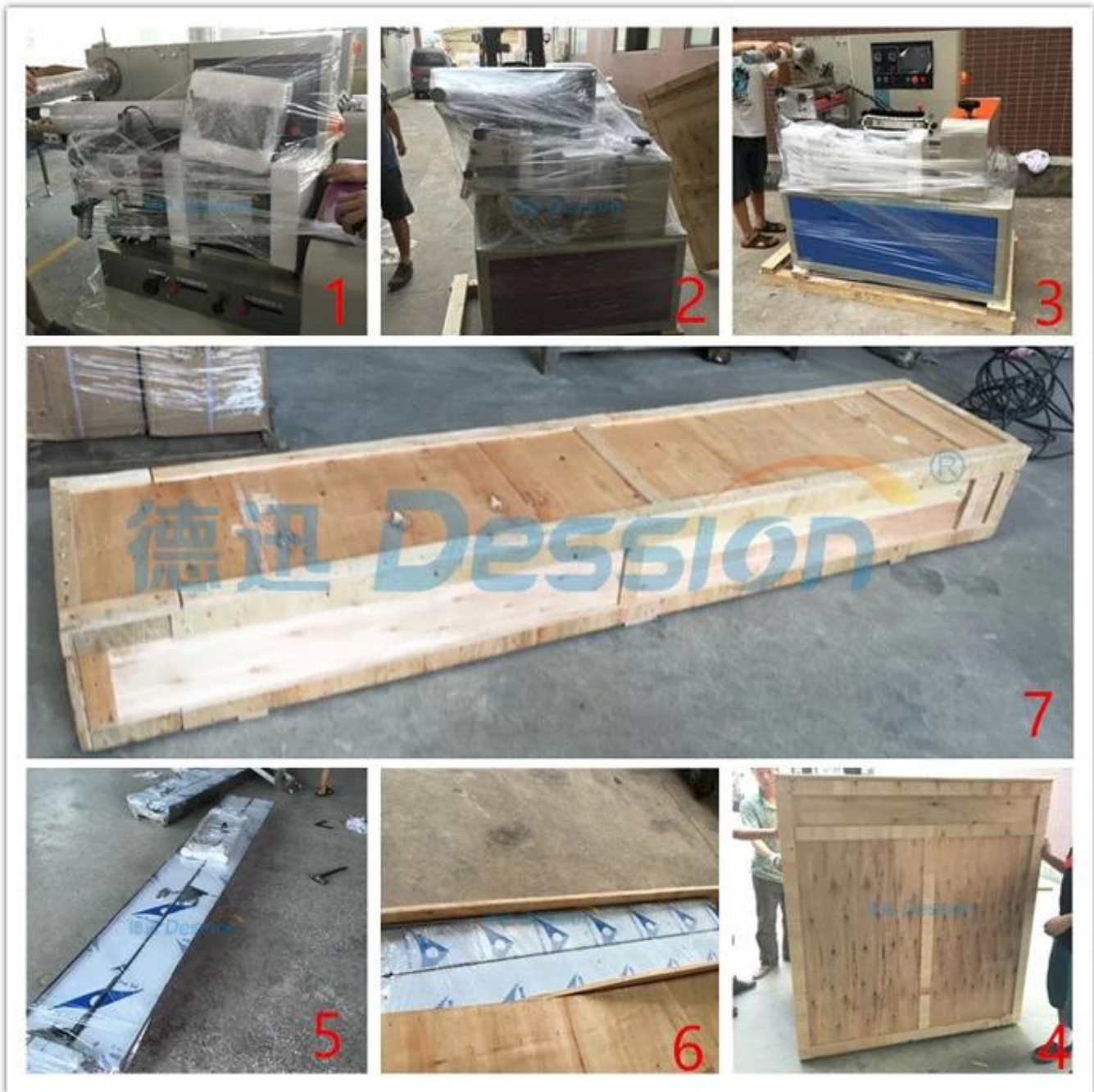
filtration equipment fill and seal horizontal packing machine