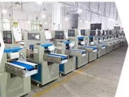
PILLOW MACHINE WORKSHOP