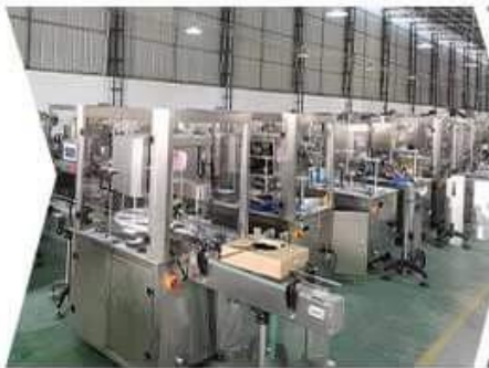
FILLING MACHINE WORKSHOP