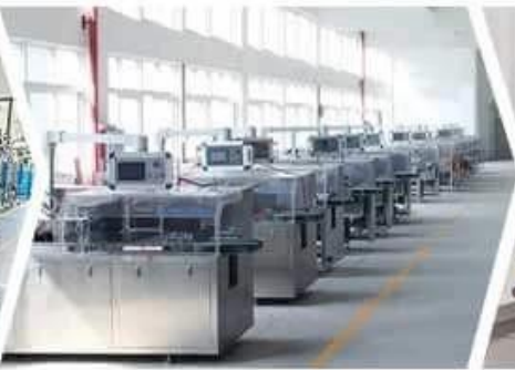
CARTONING MACHINE WORKSHOP