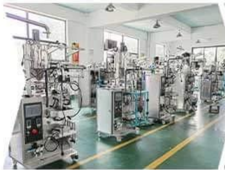
SMALL VERTICAL WORKSHOP