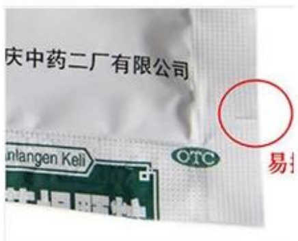
Easy Tearable device