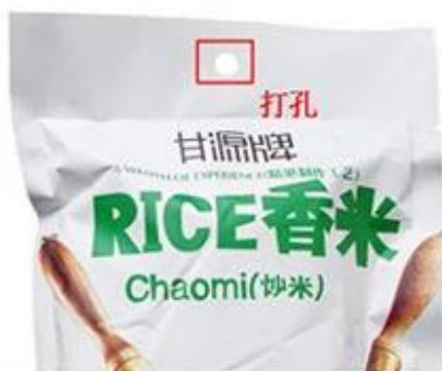
Round Punching Hole