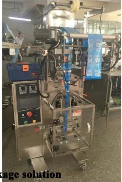
Sachet tomato ketchup package solution 20L hopper for liquid storage, can be customized