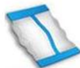
Standar pillow bag