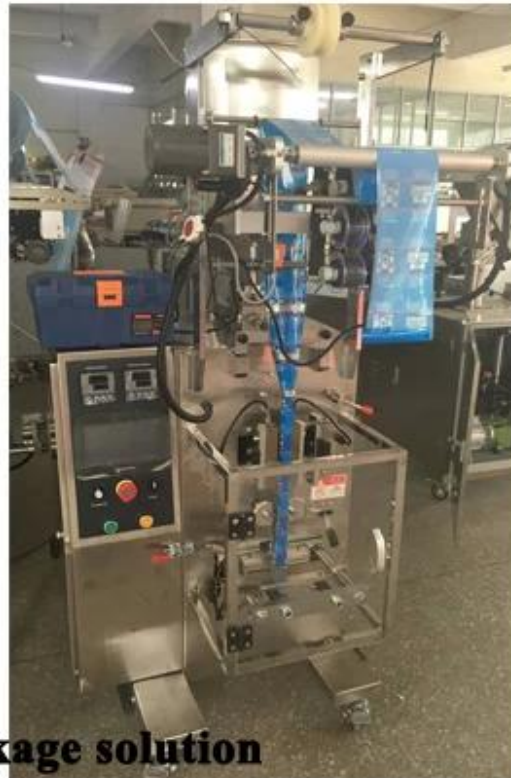
Sachet tomato ketchup package solution 20L hopper for liquid storage, can be customized