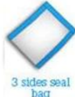
3 sides seal bag