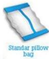
Standar pillow bag