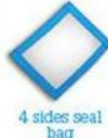
4 sides seal bag