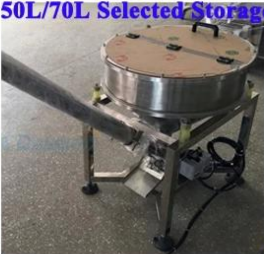
50L/70L Selected Storage Hopper