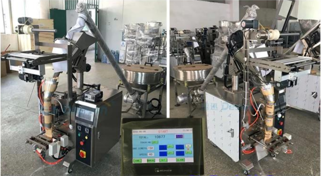
Big Touchable Screen

super touching screen, customized 50L/70L storage hopper, screw measuring equipment