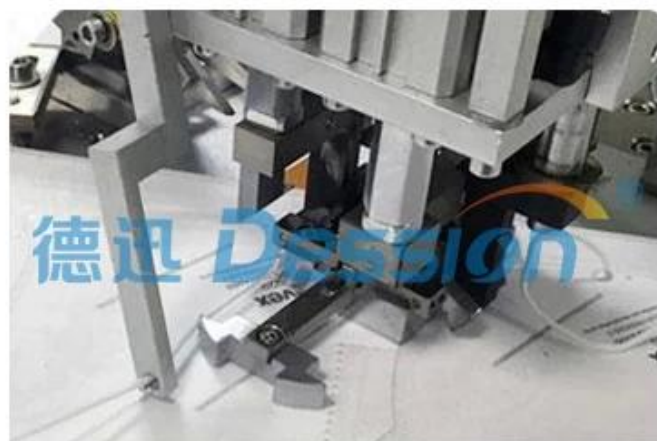
Ear loop welding