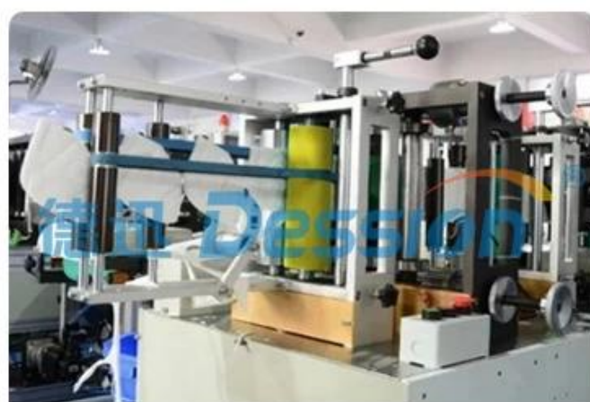
Mask cutting & output