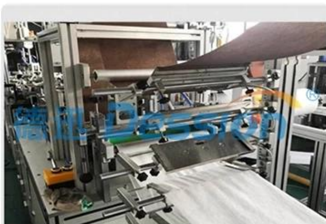
Nonwoven feeding structure