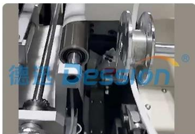
Nose bridge inserting