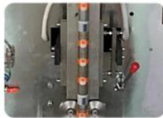
Back Sealing Mold