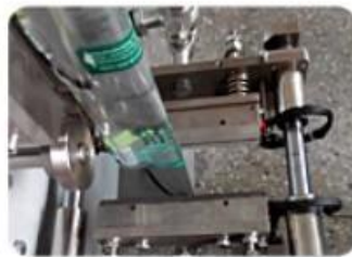
Three Side Sealing Mold