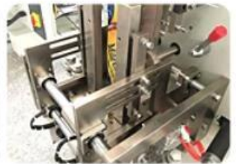
Four Side Sealing Mold