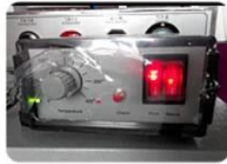
Encoder Heating Device