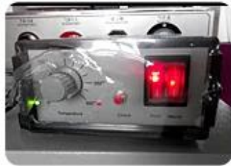
Encoder Heating Device