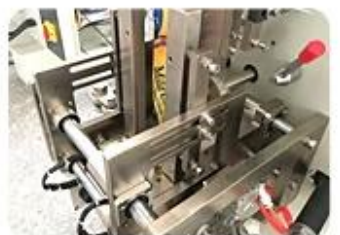
Four Side Sealing Mold