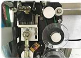
Ribbon Date Printer