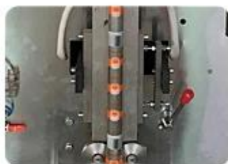
Back Sealing Mold