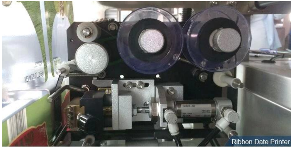
Ribbon Date Printer