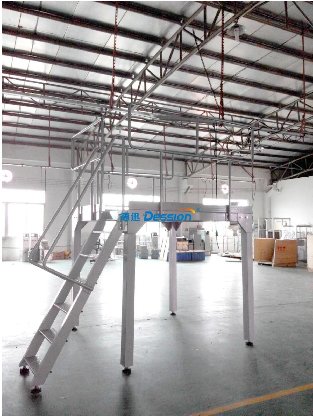
德迅 4.Z (德迅)