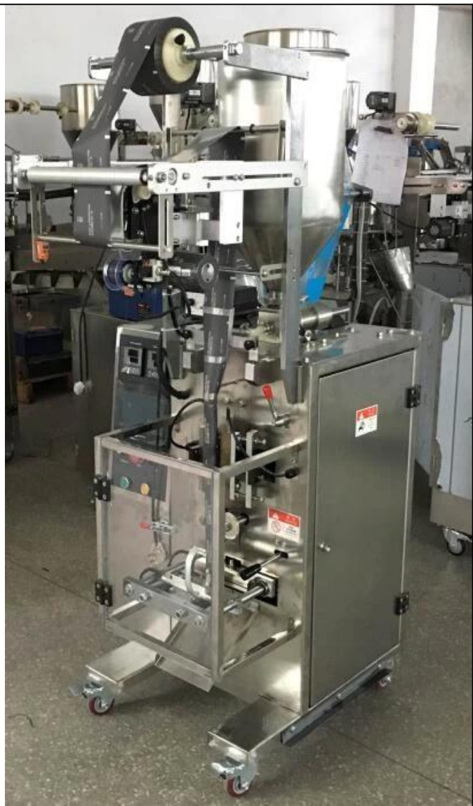
图 1-1 包装机