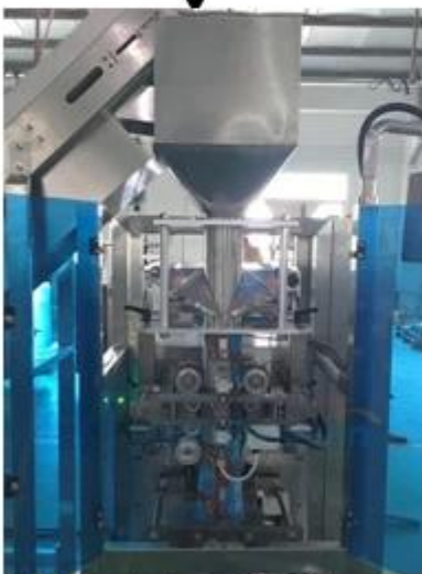
5. Material on Container