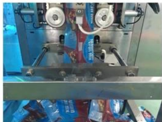
6. Bag Making