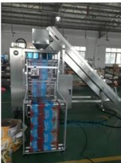
4. Film Pulling