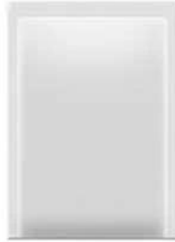
3 side sealed